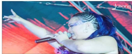
Tempo Networks debuted Virgin Islands talent Nikki Brooks "Play Me Like Pan" music video

Posted by caribemedia On May 19, 2016 0 Comment